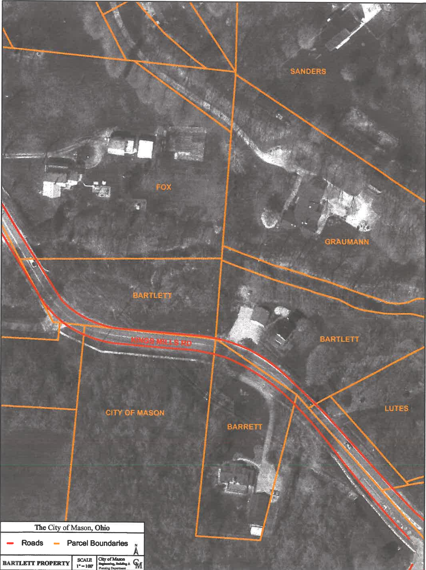
EXHIBIT tabbles A